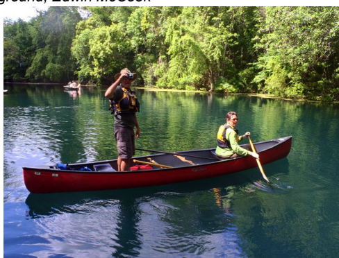
Big Blue Spring, Nigel Foster