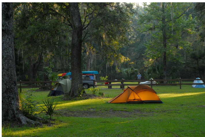
Goose Pasture Campground, Edwin McCook

Plan on camping several days at the Goose Pasture Group Campground on the Wacissa River to explore this exceptionally scenic area. There is a group camp adjacent to the public campground with portable toilets, grills and covered pavilion. Neither campground charges any fees and both are closed during general gun season. Contact the Suwannee River Water Management District to make reservations and get the gate code to the group camp: 386-362-1001, 800-226-1066 (FL toll free) or email – recreation@srwmd.org .